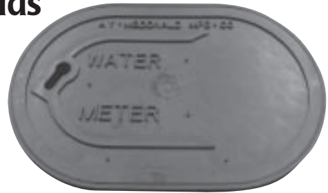
Standard Locking Lid without ERT mount or 2" hole