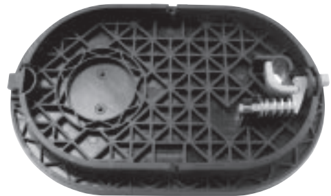
Lattice design for added strength

In response to advancing technologies in meter reading, A.Y. McDonald Mfg. Co. now offers a plastic lid for the 75-series Yoke box. This new product delivers a great benefit to customers converting to radio read systems for reading the water meter. Radio transmission signals can be read at longer distances when traveling through plastic, than the traditional cast iron lid. Lids are available in locking and non-locking styles and can be ordered with an optional under-mount carriage to support the reading device. Ask for information today!!